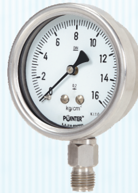
63mm Bottom Mounting