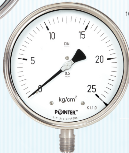
150mm Bottom Mounting