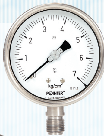
100mm Bottom Mounting