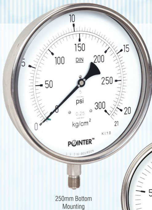
250mm Bottom Mounting

“POINTER” Weather proof gauges suitable for corrosive environment and gaseous or liquid media that will not obstruct the pressure system.